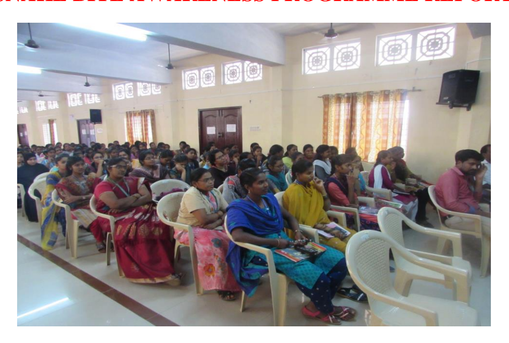
The students are listening the snake bite awareness programme